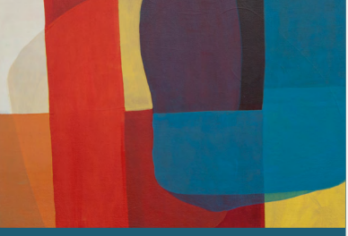
Prizes include mentoring and a solo exhibition!